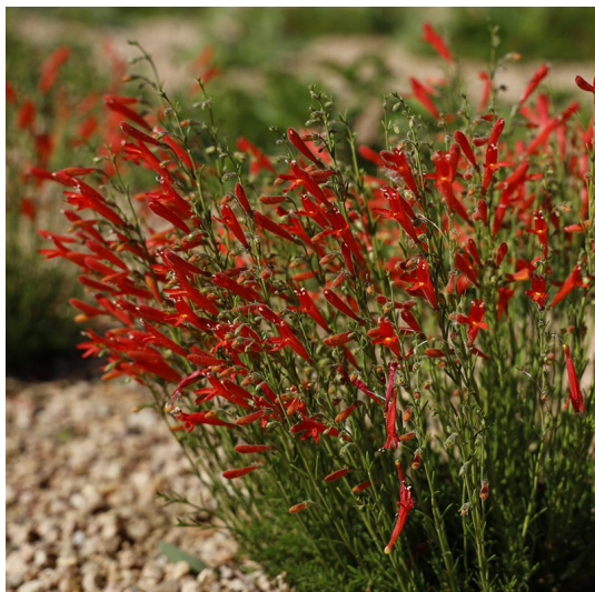
HALF PINT® pineleaf penstemon New for 2022, this long-blooming, low-growing penstemon is an eye-catcher with its scarlet-red blooms. Native to Arizona and New Mexico. Read more>