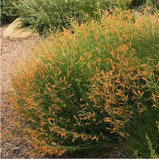
SteppeSuns® Sunset Glow This long-blooming pineleaf penstemon shines with the colors of the sunset. Native to Arizona, New Mexico, and Colorado's Western Slope and Four Corners region. Read more>