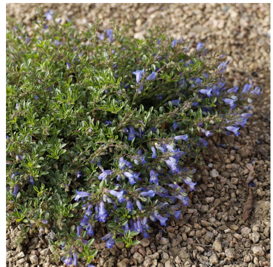
WAGGON WHEEL® bluemat penstemon Another newbie, this circular-growing penstemon makes an excellent groundcover or turf alternative in the right spots. Native to the mountains of Colorado and Wyoming. Read more >