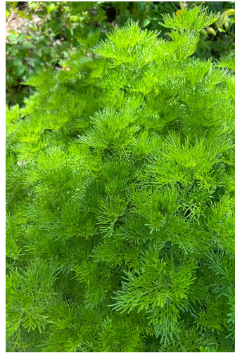
Leperchaun Southernwood (Artemisia)