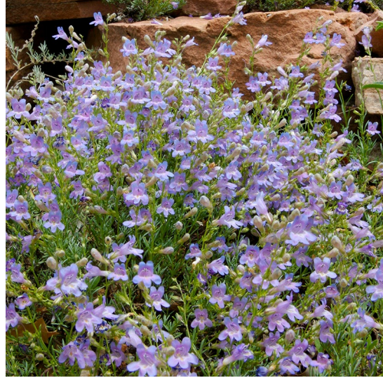
SILVERTON® bluemat penstemon This lil' penstemon is a sleeper plant that often gets overlooked. But it has so much to offer with its lavender-blue flowers and silver-green foliage. Native to Colorado, New Mexico and Arizona. Read more>