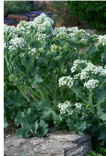
Curly Leaf Sea Kale

% Colorado State University 1173 Campus Delivery Fort Collins, CO 80523-1173 PH: (970)-481-3429