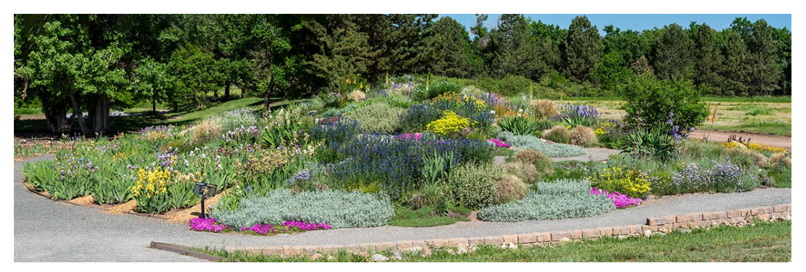
Plant Select demonstration garden at Denver Botanic Gardens Chatfield Farms

If you're new to our e-newsletter, cheers! For more than 25 years, our non-profit has tested and selected waterwise plants that thrive in the high plains and intermountain regions, so you can create smart, stunning and low maintenance landscapes with a positive environmental impact—no matter what your skill level.