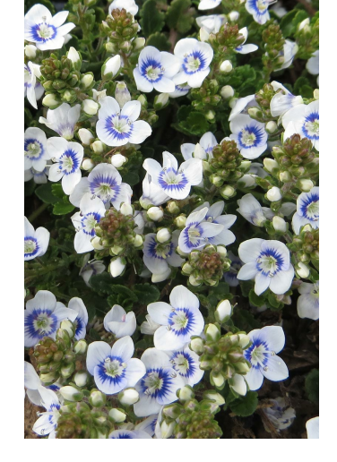
SNOWMASS® Blue-Eyed Veronica

% Colorado State University 1173 Campus Delivery Fort Collins, CO 80523-1173 PH: (970)-481-3429