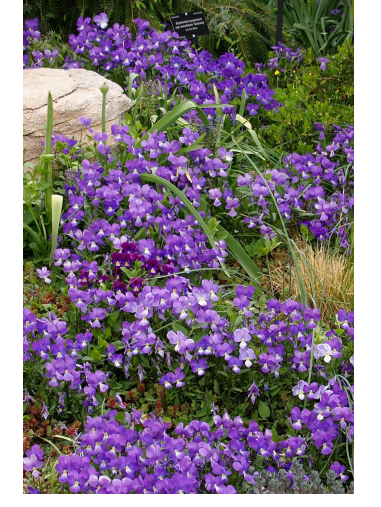
Corsican Violet (you can buy it as seed)