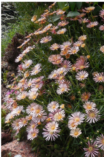
Alan's Apricot ice plant