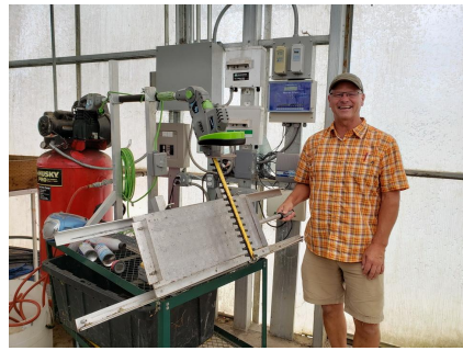
Snapshots of Perennial Favorites!

Perennial Favorites grows over 45 Plant Select plants including hard to find perennials, ornamental grasses, and a few woodies like Buddleja alternifolia 'Argentea' (Silver Fountain Butterfly Bush), Cercocarpus intricatus (Littleleaf Mountain Mahogany) Chamaebatiaria millefolium (Fernbush), Chrysothamnus ( Ericameria ) nauseosus var. nauseosus (Baby Blue rabbitbrush), and more! If you're looking for high quality finished plants, Perennial Favorites is a fantastic resource! Check out their current availability listing at perennialfavoritesnursery.com!