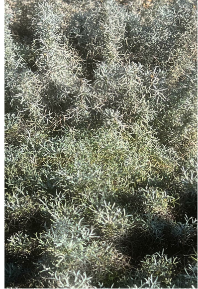
KANNAH CREEK® Buckwheat