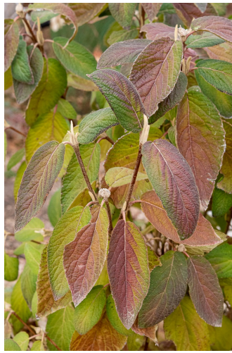
Mini Man™ Virburnum