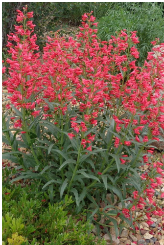
Coral Baby Penstemon