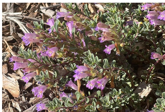
TUSHAR bluemat penstemon

In the past two years, Plant Select has introduced WAGGON WHEEL® bluemat penstemon (native to Colorado) and TUSHAR bluemat penstemon (native to Utah). Find out what makes each penstemon special in our Colorado Green article.