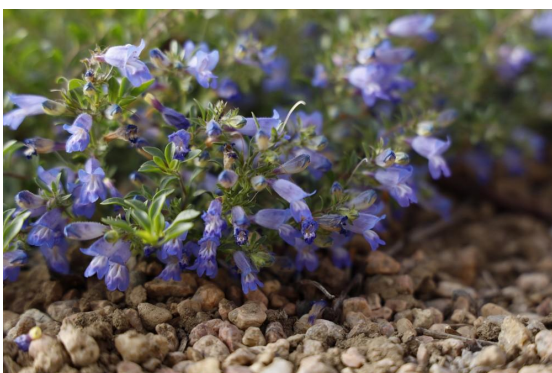
WAGGON WHEEL® bluemat penstemon

Are you familiar with bluemat penstemons? These low-growing penstemons keep their leaf color through fall and much of the winter, helping you create a prettier winter garden. Plus, they produce cute, trumpet-like flowers in early summer.