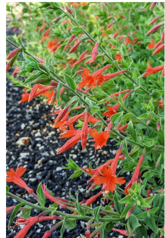
ORANGE CARPET® Hummingbird Trumpet

Botanical names: Penstemon barbatus 'Coral Baby' Achnatherum calamagrostis 'PUNDO2S' Epilobium canum subsp. garrettii 'PWWG01S' (formerly, Zauschneria garrettii 'PWWG01S')