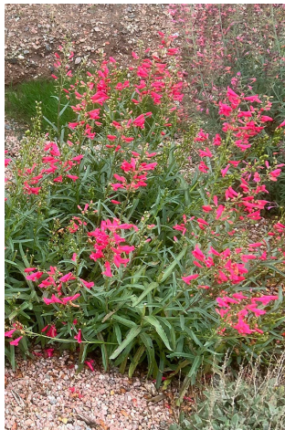
Coral Baby Penstemon