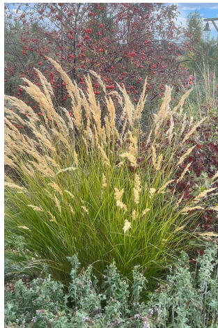
UNDAUNTED® Alpine Plume Grass