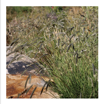
FREEDA™ Caterpillar Grass

Add these beauties to your landscapes starting next spring Our 2022 collection will soon be here!