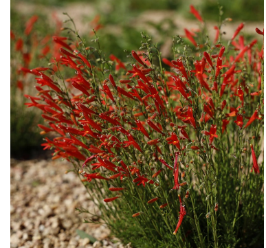
HALF PINT™ Pineleaf Penstemon

This native Liatris is a hummingbirds and goldfinches. With its