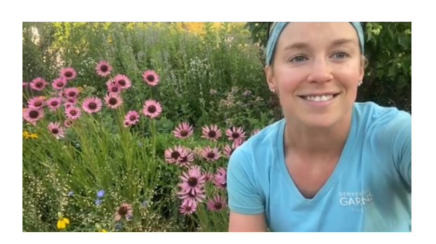
Find Echinacea tennesseensis at a Plant Select member garden center near you!