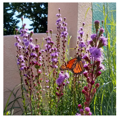
Blazing Star Meadow Gayfeather

This ornamental grass offers big entertainment favorite among Monarch on this compact value all year. Its flowers butterflies, native bees, initially resemble caterpillars, but unfurl