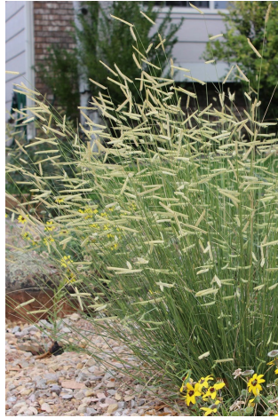
Blonde Ambition Blue Grama