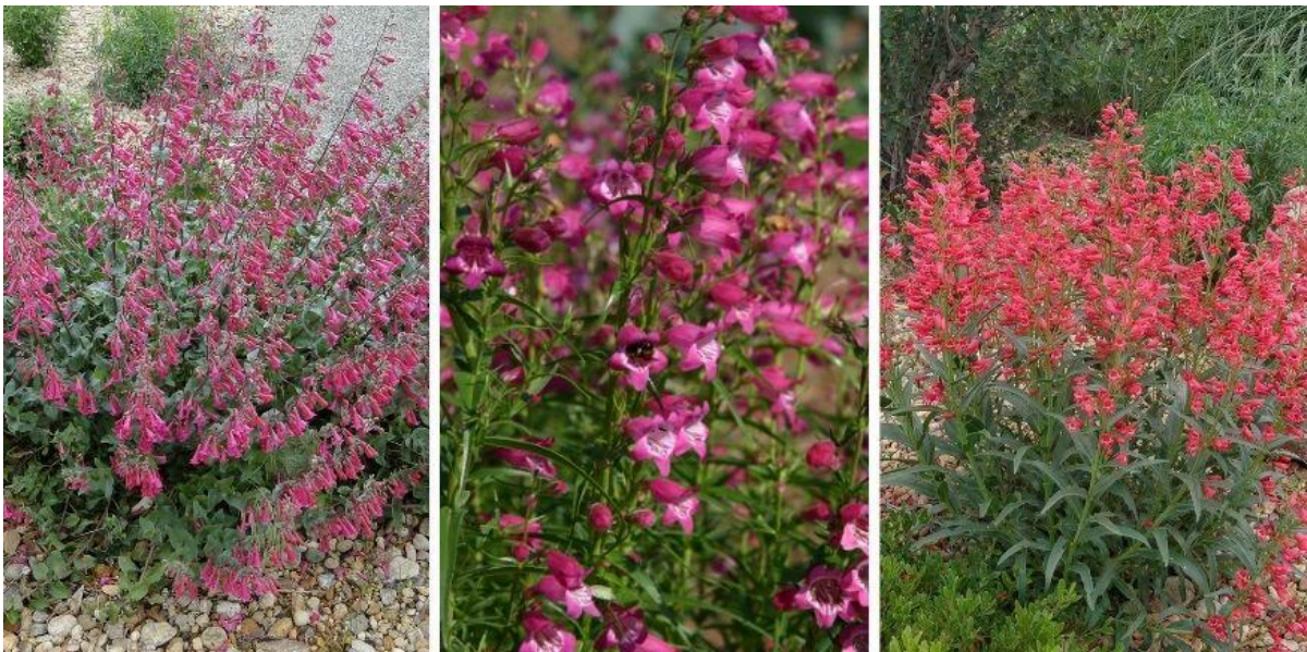
Pictured above: Desert penstemon ( Penstemon pseudospectabilis ), RED ROCKS® penstemon ( Penstemon 'P008S' | Mexicali hybrid), Coral Baby penstemon ( Penstemon barbatus 'Coral Baby').