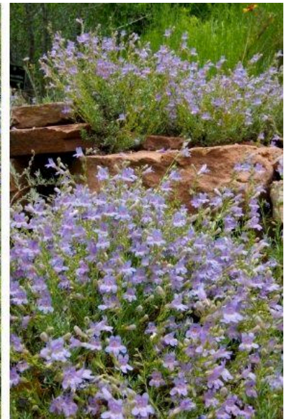
Pictured above: WAGGON WHEEL® bluemats penstemon ( Penstemon caespitosus 'P022S'). Grand Mesa beardtongue ( Penstemon mensarum ). SILVERTON® bluemats penstemon ( Penstemon linarioides subsp. coloradoensis 'P014S').

There are about 250 species of Penstemon native to the United States with the majority in the western U.S. (Utah wins the prize for the most.) These plants range from towering prima donnas to humble species that hug the ground. And yes, they span the rainbow.