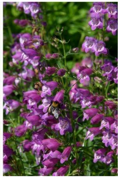
Pictured above: Tushar bluemats penstemon ( Penstemon xylus ). PRAIRIE JEWEL® penstemon ( Penstemon grandiflorus 'P010S'). PIKE'S PEAK PURPLE® penstemon ( Penstemon 'P007S' | Mexicali hybrid).