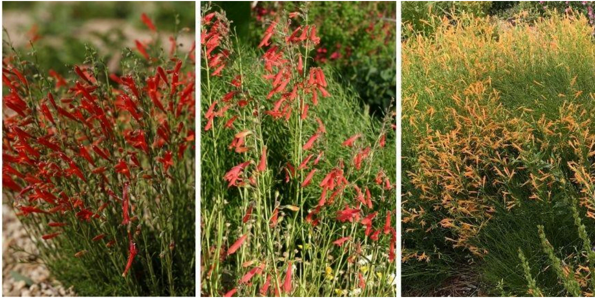
Pictured above: HALF PINT® pineleaf penstemon ( Penstemon pinifolius 'Compactum'), Bridges' penstemon ( Penstemon rostriflorus ), SteppeSuns® Sunset Glow penstemon ( Penstemon pinifolius 'P019S0).

Most of Plant Select's penstemons have interesting foliage in the winter too, so your landscape can turn heads year-round.