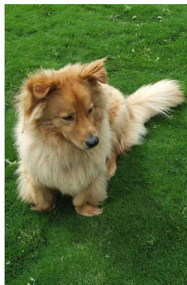
Dog Tuff™ turf grass