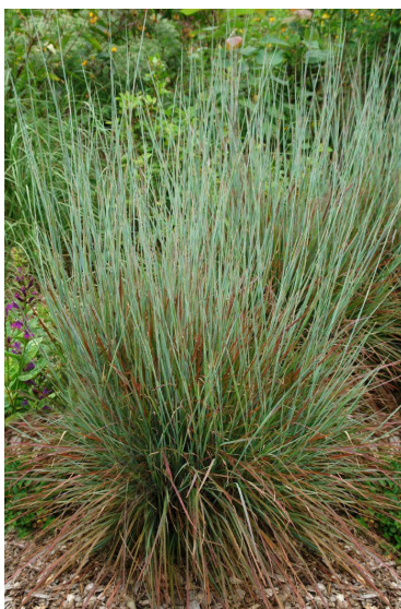
Standing Ovation little bluestem grass