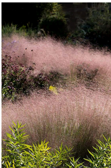
UNDAUNTED® Ruby muhly grass

Pro tip: May is usually an ideal time to plant warm season grasses , even though they don't look their showiest at the garden center right now. (They're just waking up.)