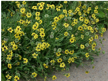
Chocolate flower Berlandiera lyrata

Many perennials call it quits by early September, but not the high achievers below. They can flower well into fall, especially when we haven't had a hard freeze. You'll get lovely, late-season color that will have neighbors stopping to admire your yard. (Plus, you'll feed pollinators that are still foraging for food.)