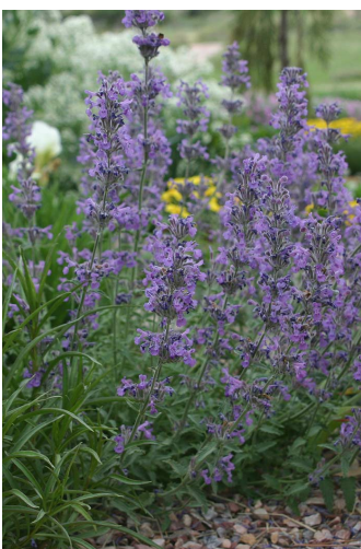
LITTLE TRUDY® catmint Nepeta 'Psfike'