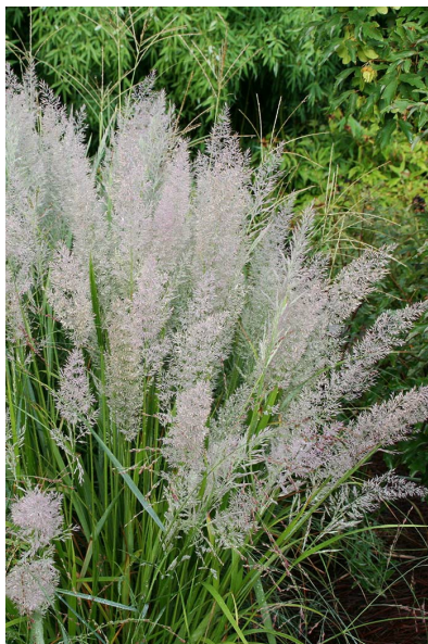
Korean feather reed