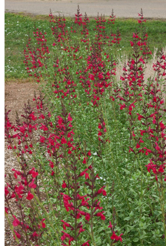
WINDWALKER® Royal Red salvia Salvia darcyi x S. microphylla 'PWIN03S'