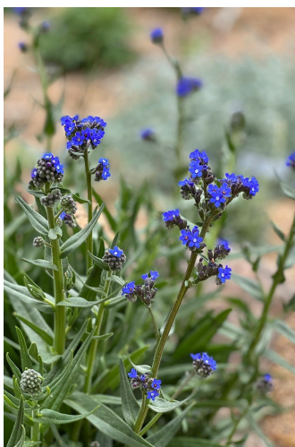
Cape forget-me-not Anchusa capensis