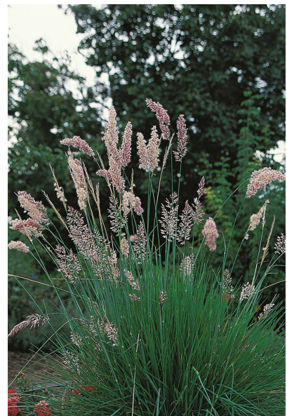
PINK CRYSTALS® ruby