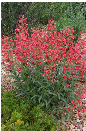
Coral Baby penstemon Penstemon barbatus 'Coral Baby'