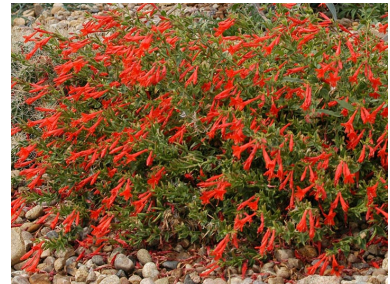
ORANGE CARPET® hummingbird trumpet Epilobium canum subsp. garrettii 'PWWG01S'