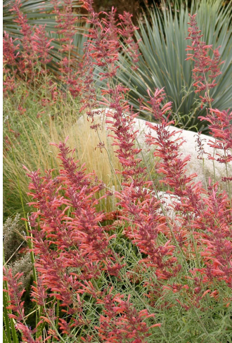
Hyssops, like SUNSET® hyssop Agastache rupestris