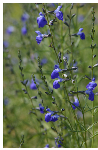
Autumn Sapphire[™] sage Salvia reptans 'P016S'