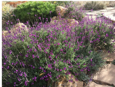
Ultra Violet salvia Salvia 'Ultra Violet'