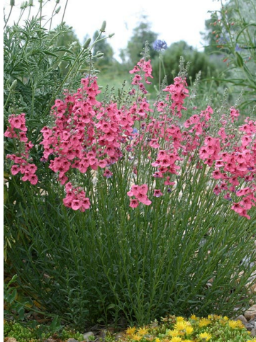
CORAL CANYON® twinspur Diascia integerrima 'P009S'