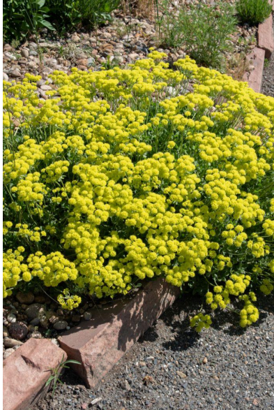
KANNAH CREEK® buckwheat