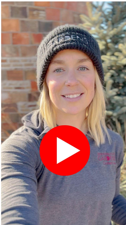
What is Plant Select?