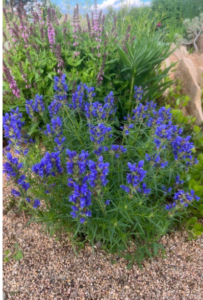
Indigo blue dragonhead