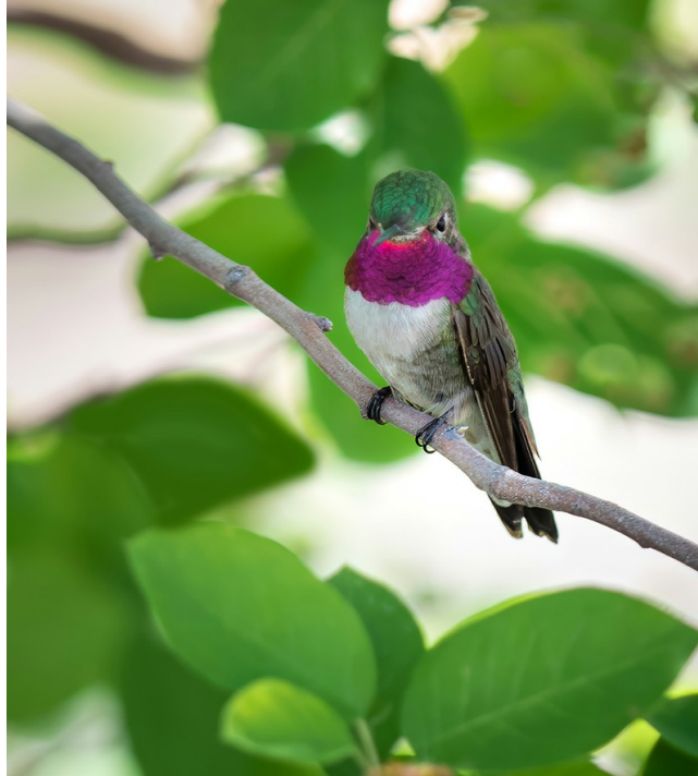
Broad-tailed Hummingbird at Denver Botanic Gardens Chatfield Farms