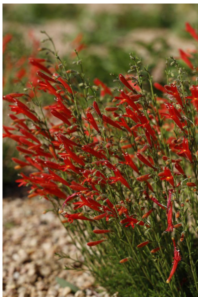
HALF PINT® penstemon

Hummingbirds are headed north. Are you ready?