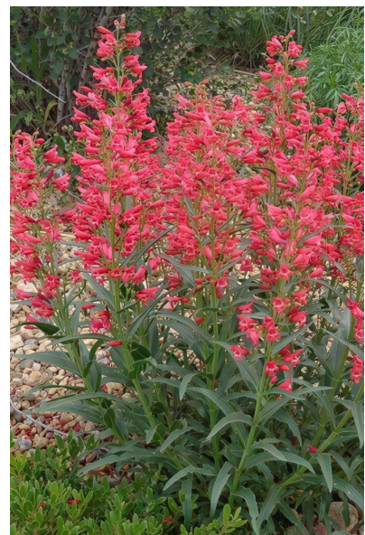
Coral Baby penstemon