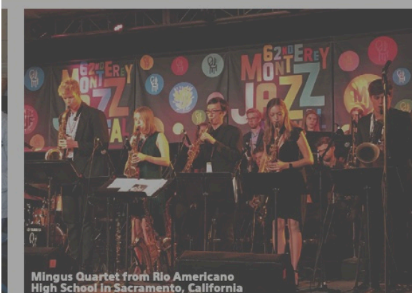
Mingus Quartet from Rio Americano High School in Sacramento, California