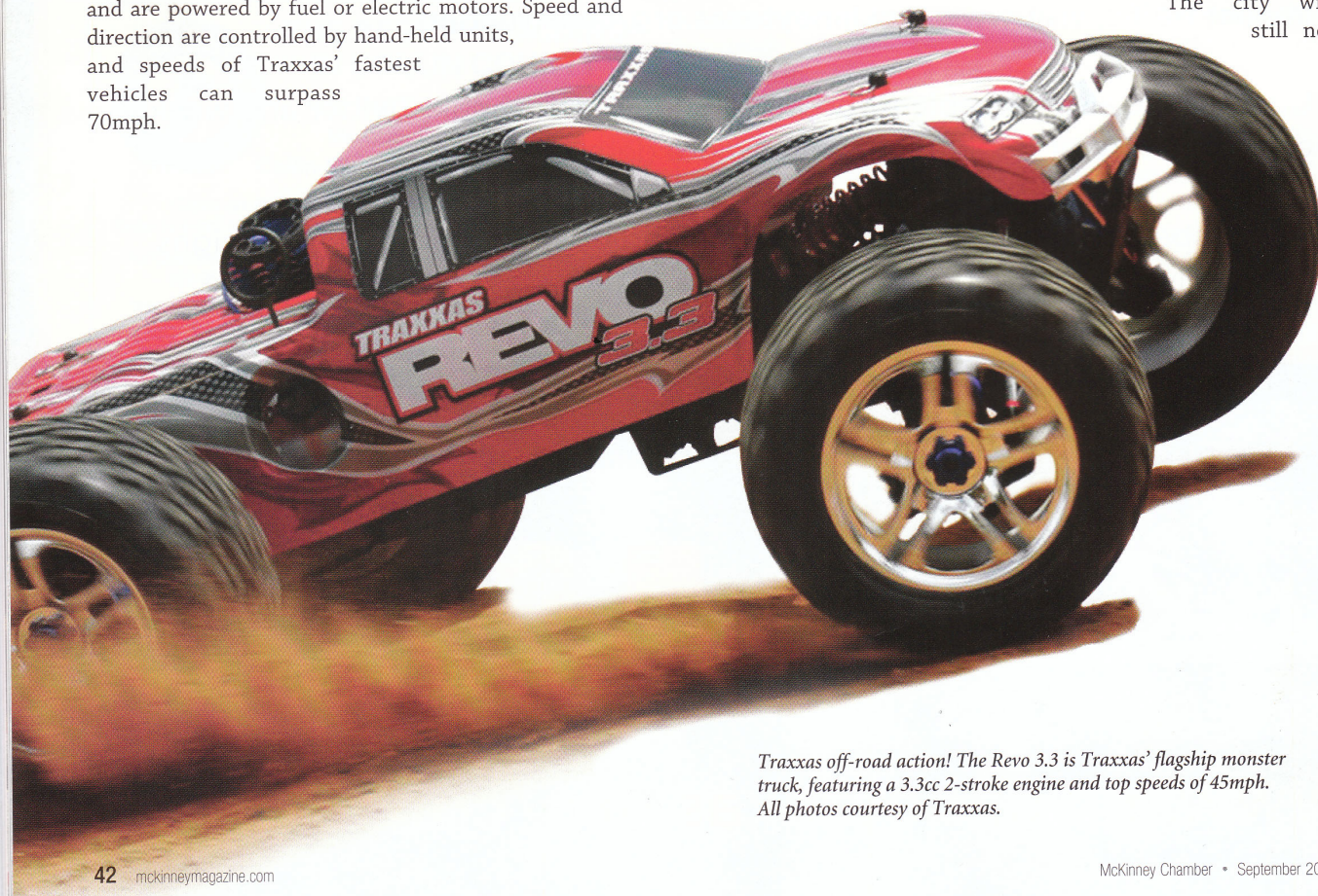
Traxxas off-road action! The Revo 3.3 is Traxxas' flagship monster truck, featuring a 3.3cc 2-stroke engine and top speeds of 45mph.