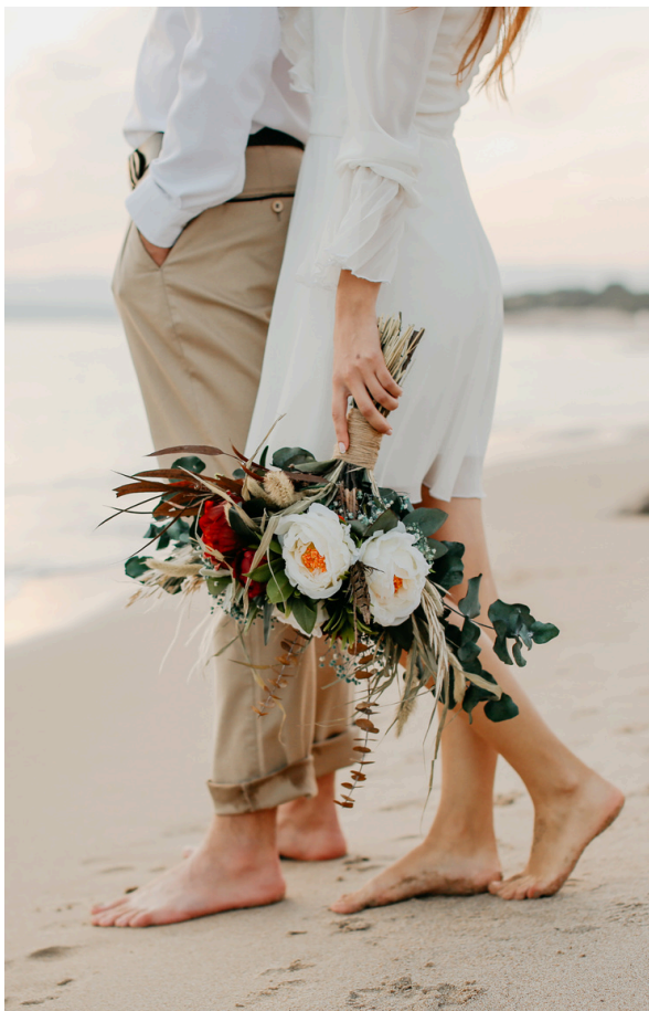
Day of Coordination