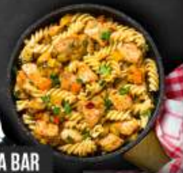
→ PASTA BAR