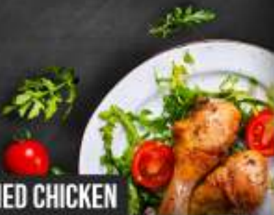
→ FRIED CHICKEN