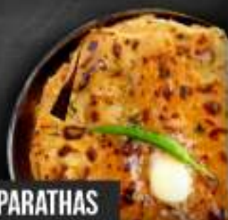
→ ROTI & PARATHAS