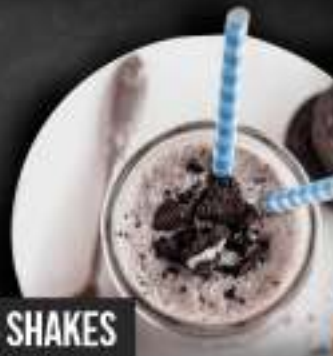
→ THICK SHAKES