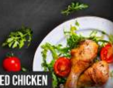
→ FRIED CHICKEN