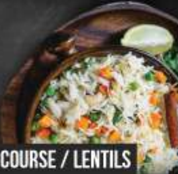
→ MAIN COURSE / LENTILS