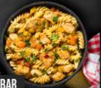
→ PASTA BAR