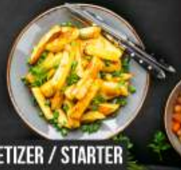
→ APPETIZER / STARTER