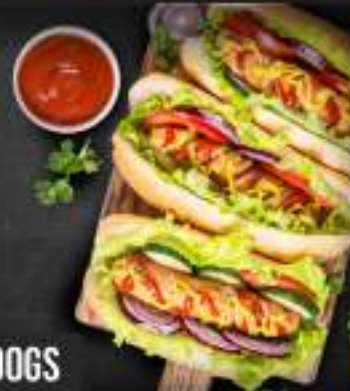
→ HOT DOGS