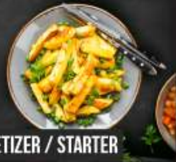
→ APPETIZER / STARTER