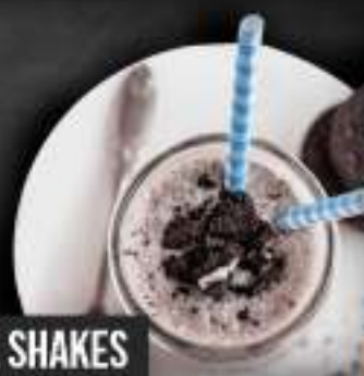
→ THICK SHAKES