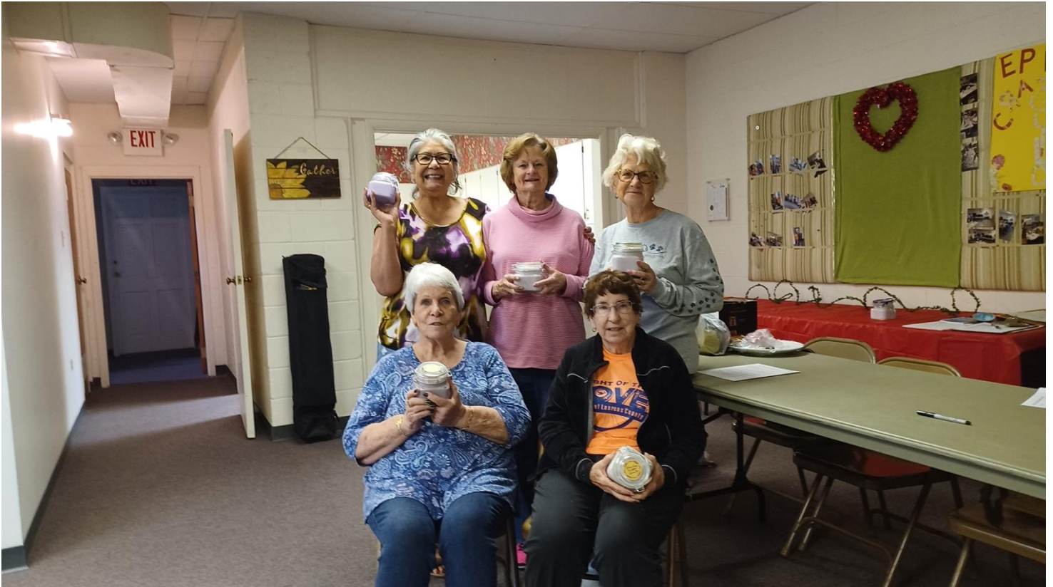
Photos from February 15 Oyster Roast