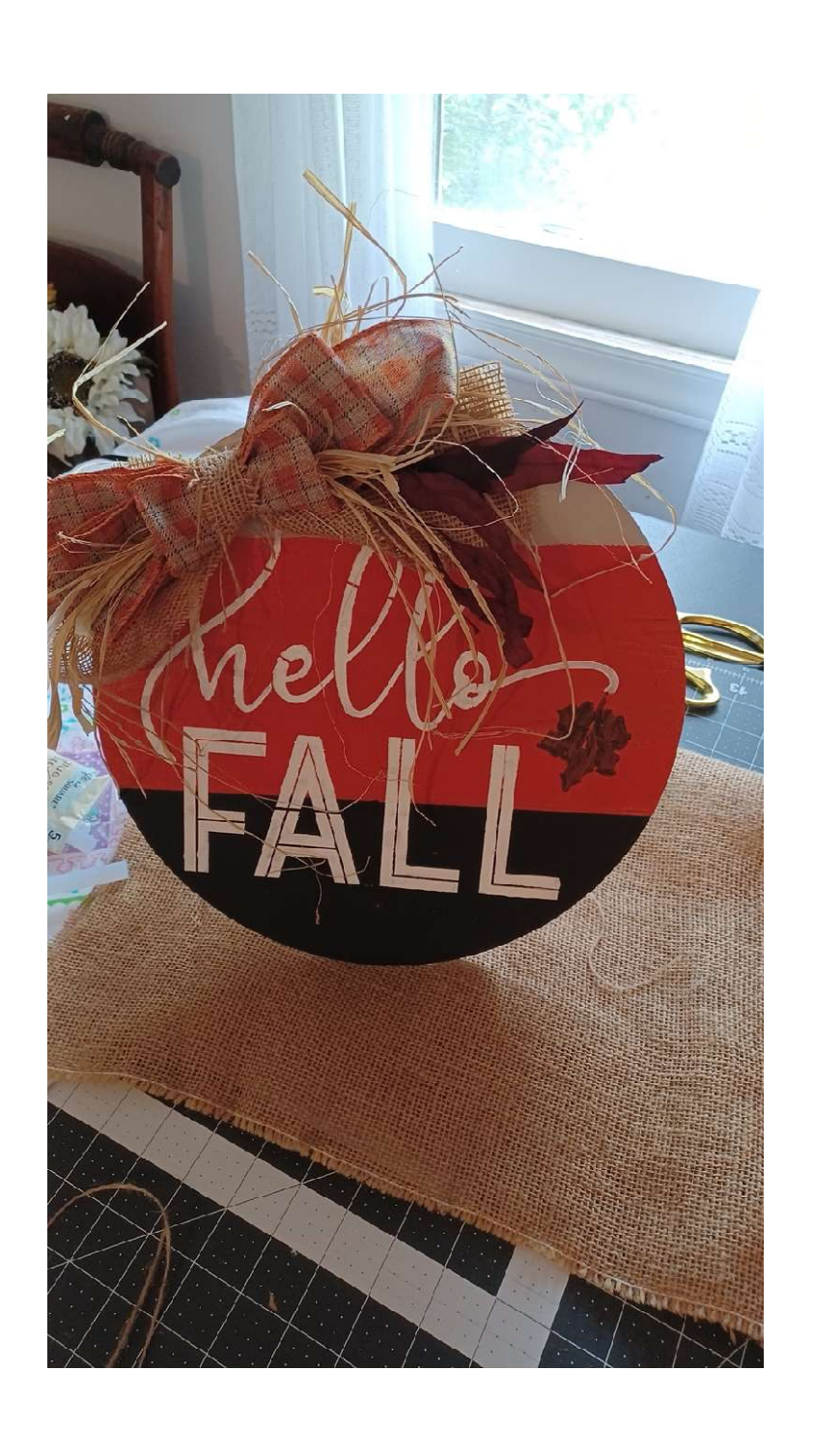
From Hope Deason Be Ready For Fall Stencil Class 101. SEPTEMBER 21