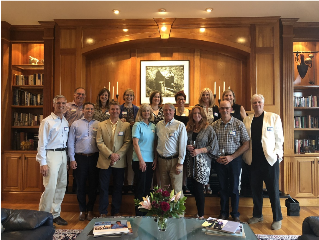
SEHOA and SHOA Board Members and Spouses enjoyed a social gathering June 18th