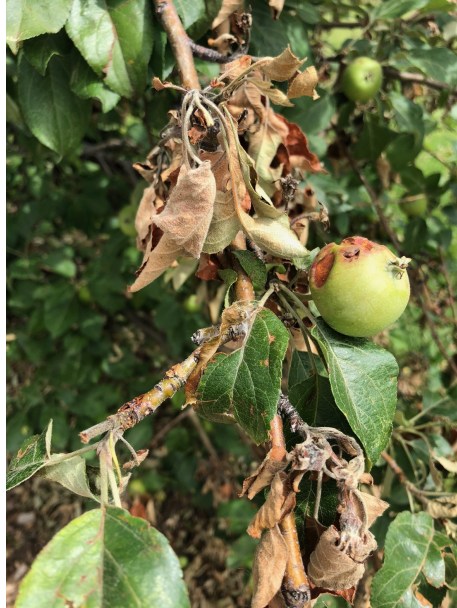
Fire Blight in Somerset Estates, June 2018

Are you seeing dead leaves and shriveled branches on some of your trees? If so, you may want to have an arborist examine your trees for Fire Blight, a disease that has been found in our neighborhood primarily affecting fruit trees. Two helpful links include: A recent article in the Boulder Daily Camera and an information page on Fire Blight by Taddiken Tree Company .