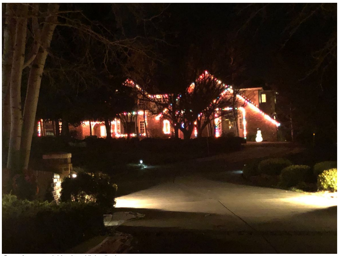
One of many neighborhood light displays

Visit the SEHOA website to see a photo gallery showing several examples of our neighbors' efforts to celebrate the season with light displays. Or better yet, take a drive after dark and enjoy the creative displays around Somerset Estates.