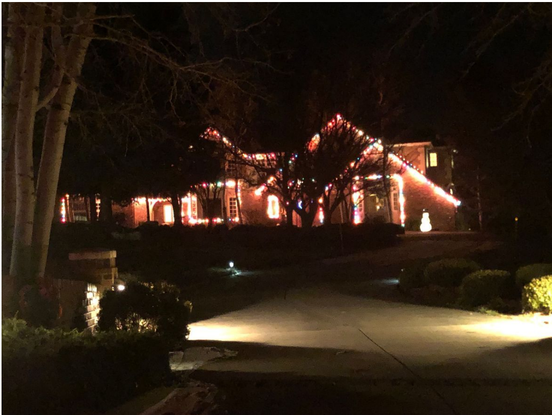
One of many neighborhood light displays

Visit the SEHOA website to see a photo gallery showing several examples of our neighbors' efforts to celebrate the season with light displays. Or better yet, take a drive after dark and enjoy the creative displays around Somerset Estates.