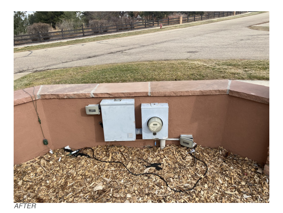
Fence Along Pathway Repaired

The fence on the north side of the pathway from Longview Dr toward the end of Primrose Ln was damaged by a driving accident originating in the adjacent Autumn Ridge lot; this has been repaired at that homeowner's expense. In addition, several of the fence posts needed to be replaced or repaired along the length of the fence. This work is complete, including staining the fence.