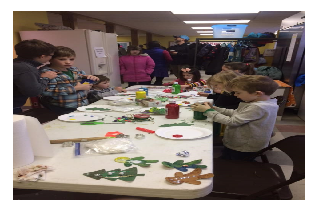
This was Santa Breakfast Craft Table

Art materials will be provided for children and their accompanying adults to make cards for the special people they love. This has a been a very popular activity at the Christmas breakfast and we hope that families can stop by to give it a try for the February holiday. (In case of bad weather we will reschedule for February 9, still in time for February 14 card delivery.)