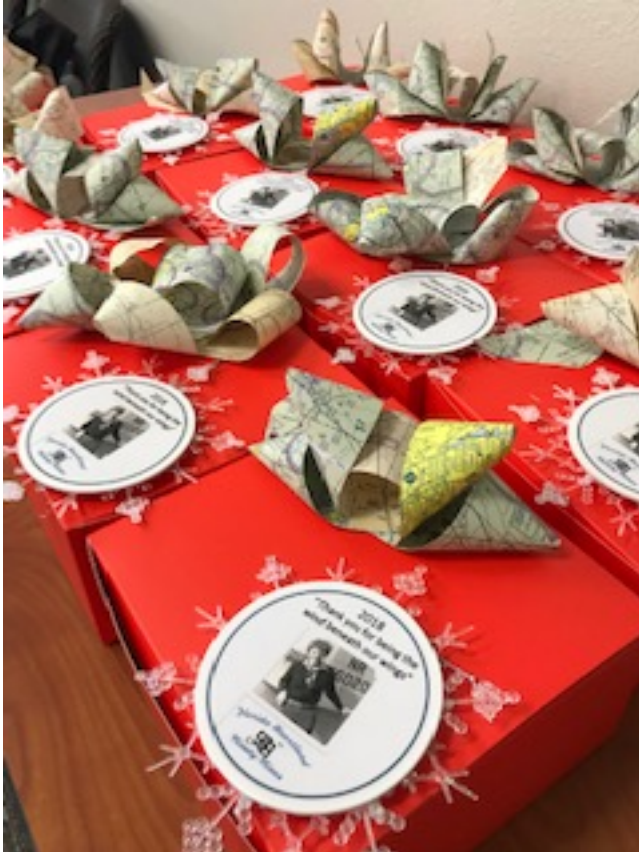
The beautiful Boxes given out this year.

As has been our tradition now for the third year, we made 16 boxes of goodies for the area EAA, FBO, and tower organizations. Bows were made out of aeronautical charts and a FL Heartland gift ornament was also included with this years' box of goodies.