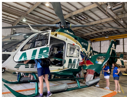
AirMed Operations Tour