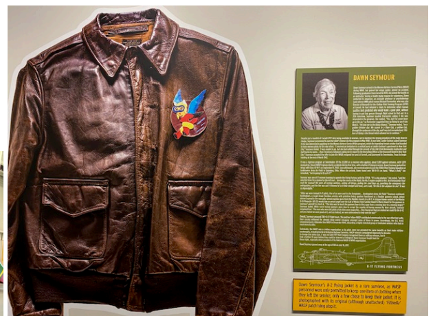
Rare WASP jacket with Fifinella logo