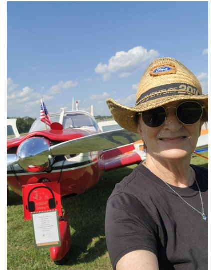
Sandypoint Settlement, The Bahamas