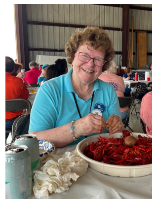
EAA Crawfish Boil