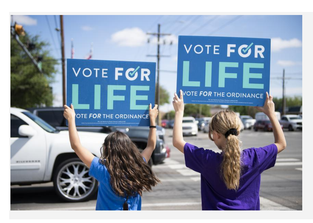
In May, children in Lubbock held signs supporting Proposition A, a local ordinance which would ban abortions in the city.

At first, it was just small towns that passed these ordinances. None of them even had abortion providers within city limits. These so-called "sanctuary cities for the unborn" faced legal challenges but were largely allowed to keep the ordinances on the books.