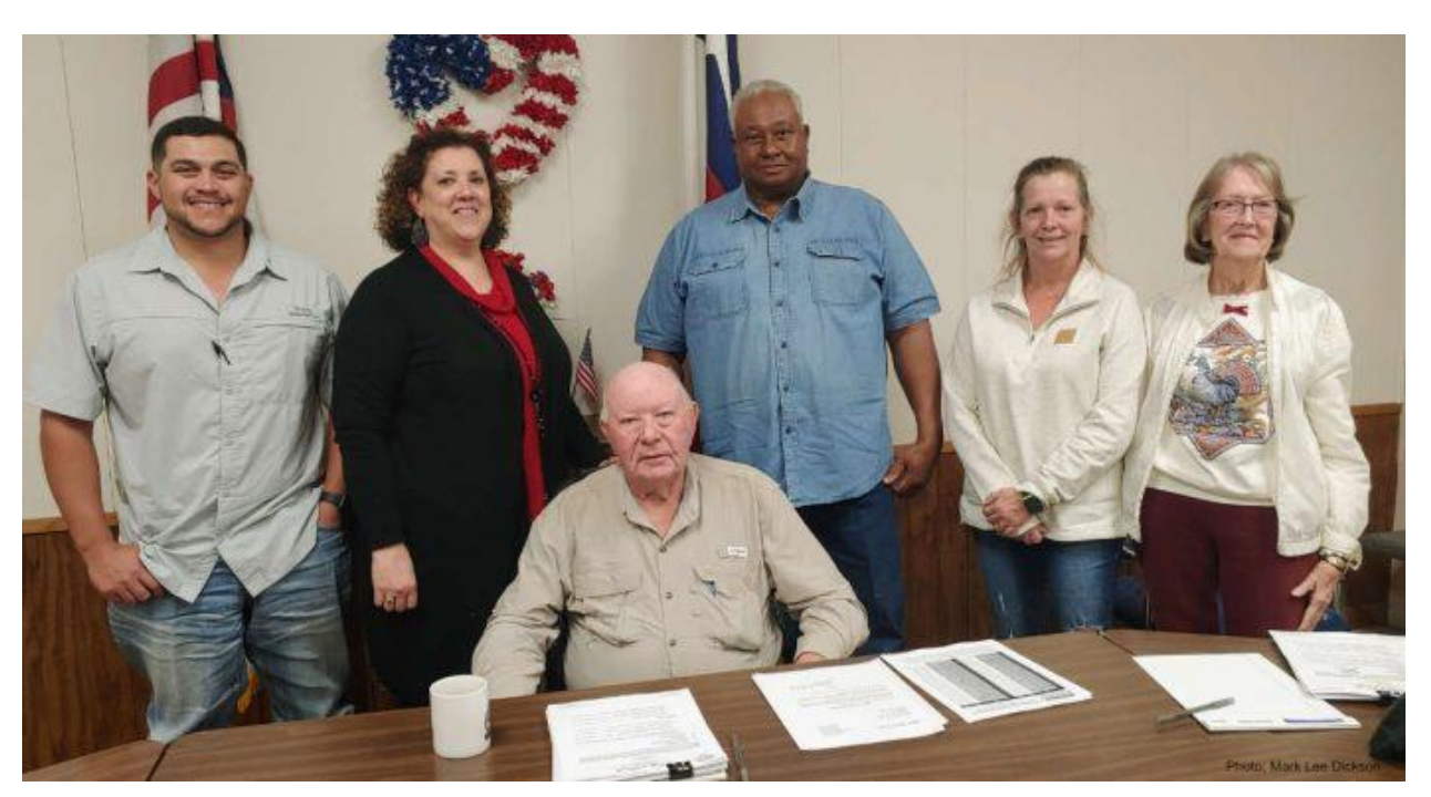
Jewett mayor and city council

The Jewett Ordinance reads: "It shall be unlawful for any person to procure or perform an abortion of any type and at any stage of pregnancy in the City of Jewett, Texas" and "It shall be unlawful for any person to knowingly aid or abet an abortion that occurs in the City of Jewett, Texas."