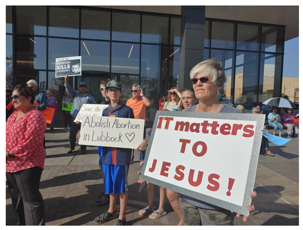
Citizens gather outside Lubbock City Hall in 2020 to call upon their leaders to outlaw abortion.

said, "Pro-Life Victory! In a major and historic victory for the right to life, Planned Parenthood is dropping its lawsuit over the city of Lubbock's abortion ban, ensuring that the ordinance will remain in effect!"