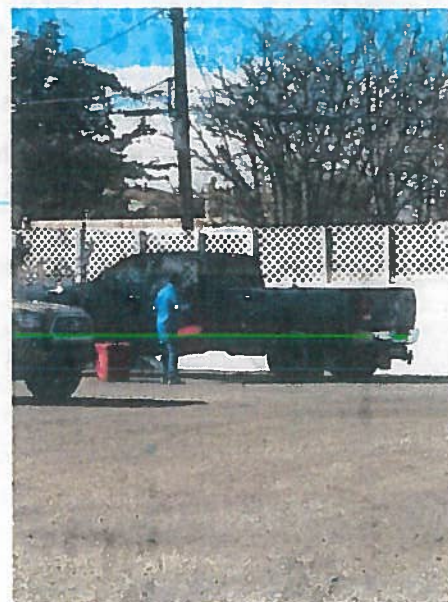
3 photos ABOVE taken November 6, 2020