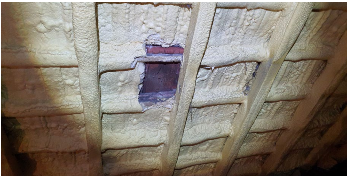
Figure 1: Spray foam used to stabilise a failing roof cover; a thin coating with limited heat retention but significant water problems

This guide also does not apply to roofs where a type of foam was applied to glue the roof tiles together. This is often done when an old roof is in need of replacement and the owner used spray foam as a less costly remedy to put off replacement and the primary reason was not to improve thermal performance. These roofs are often already past economic repair where the next action would be replacement.