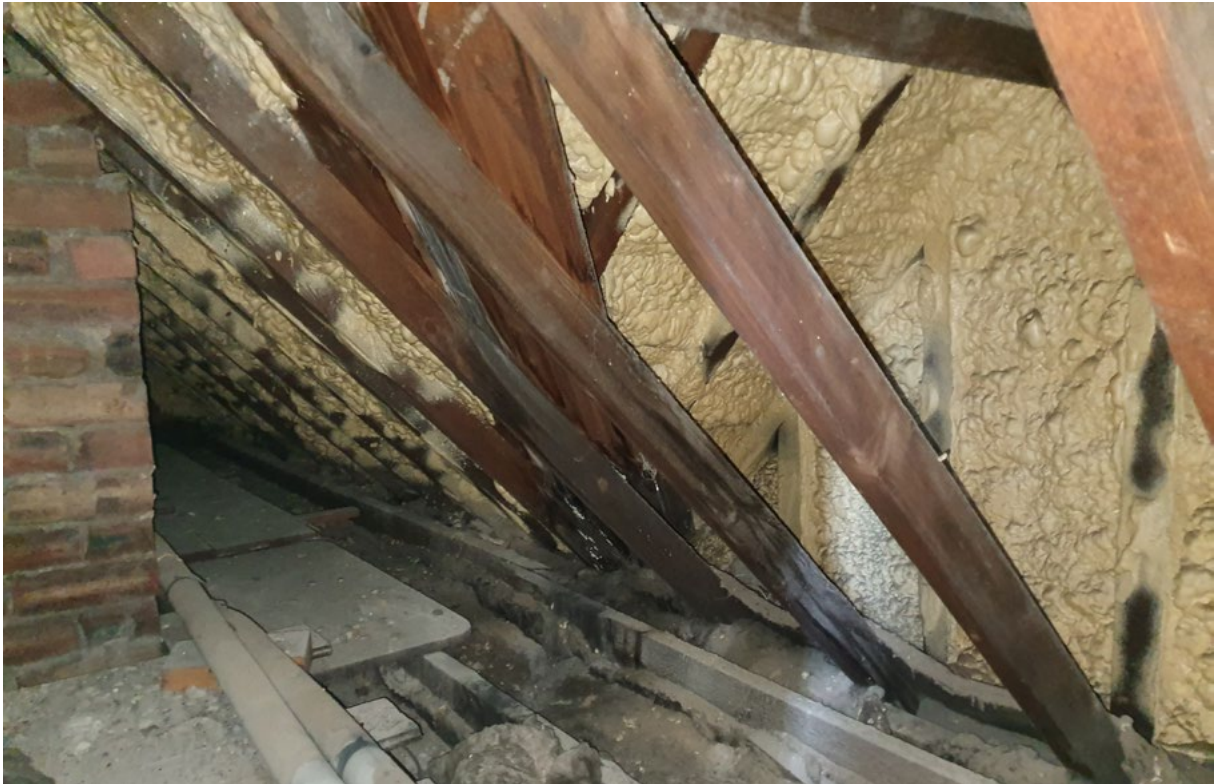
Figure 4: Example of spray foam incorrectly installed leading to condensation problems

RICS advises homeowners to seek independent expertise, commercially separated from the installer and manufacturer, to advise if spray foam is appropriate for their property. See the section Installing spray foam insulation in your home for more detail.