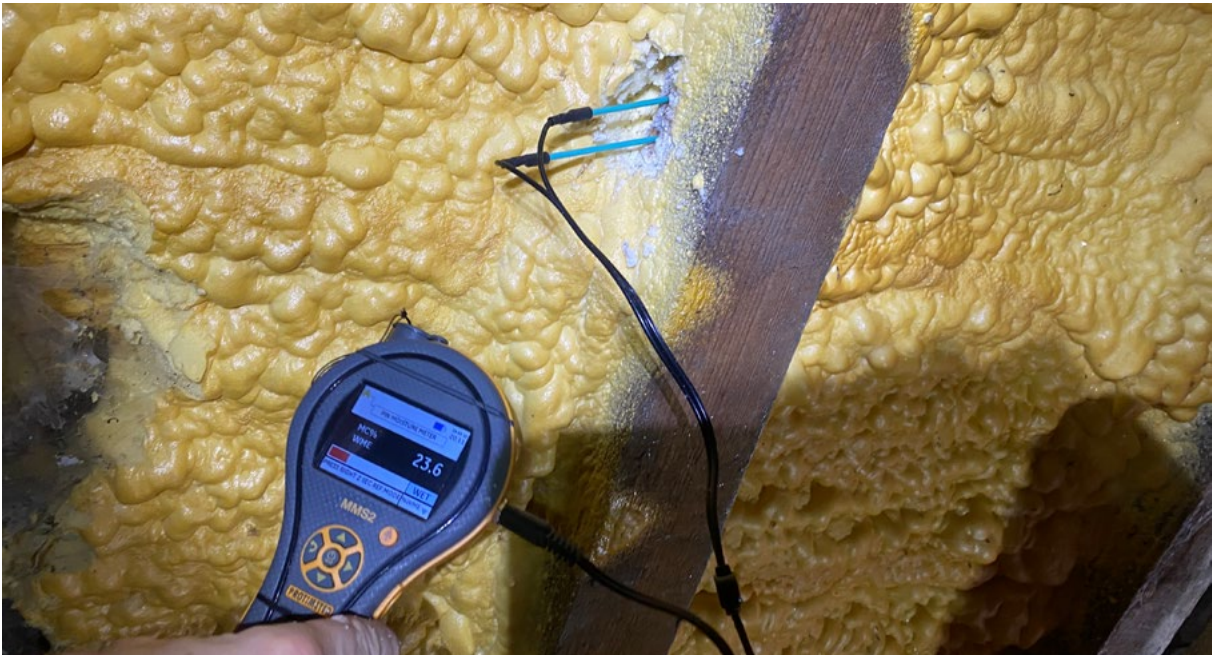
Figure 3: Spray foam insulation can make it difficult to identify problems to the roof because the timbers can be 'dry' on their exposed, visible surface but 'wet' behind the spray foam