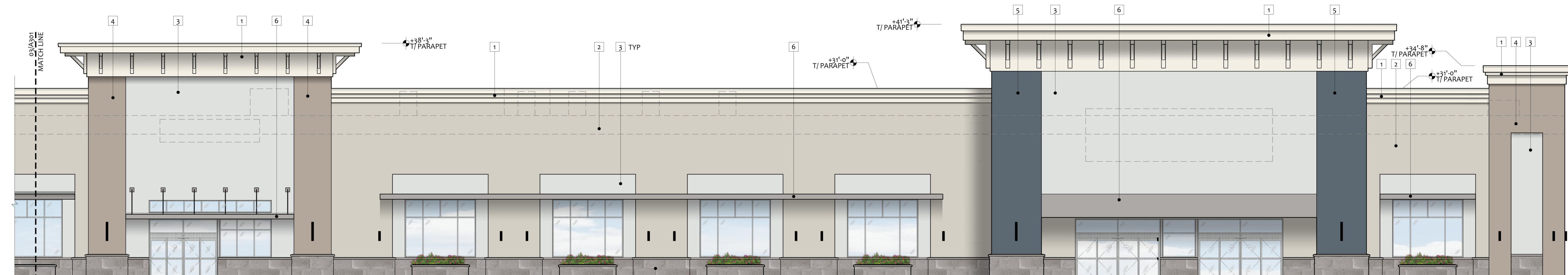
02 ENLARGED PARTIAL ELEVATION (EAST/FRONT) 1/8" = 1'-0"