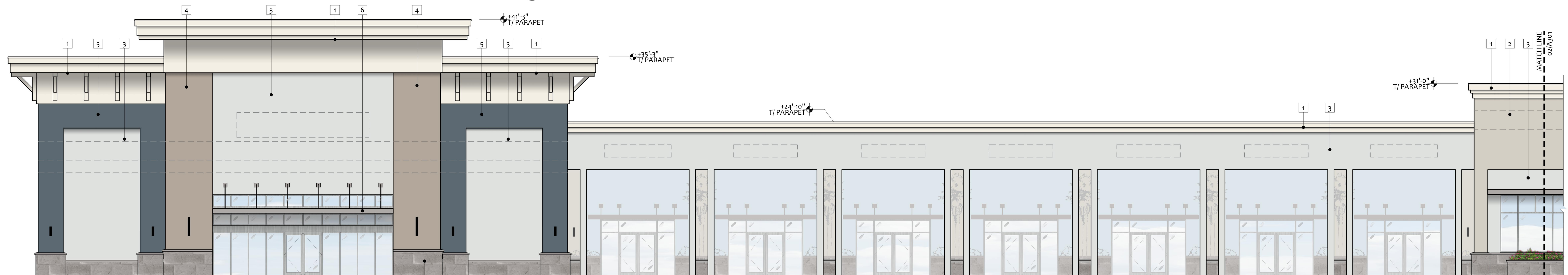
03 ENLARGED PARTIAL ELEVATION (EAST/FRONT) 1/8" = 1'-0"