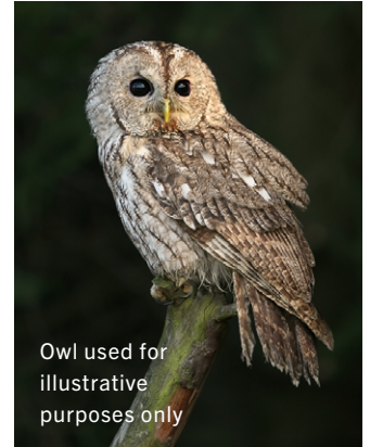
Owl used for illustrative purposes only

Remember to listen out for them when Autumn comes.