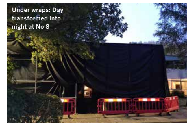
Under wraps: Day transformed into night at No 8

We stayed in the house for the first two nights, and it was utterly surreal. Waking up when it should be light but finding ourselves in pitch darkness was disorienting. Because the garden was also enclosed, the darkened trees and bushes tricked your mind into thinking it was