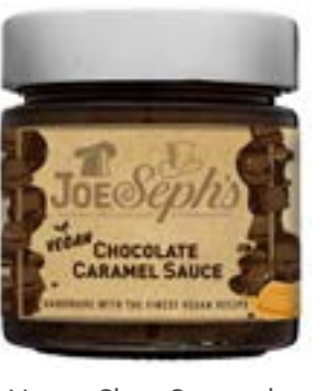
Vegan Choc Caramel