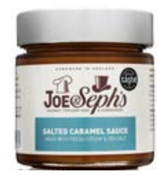
Salted Caramel Sauce