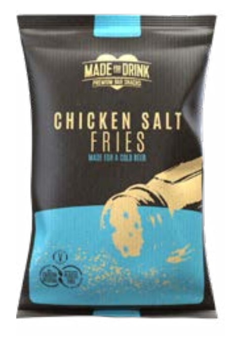
Chicken Salt Fries