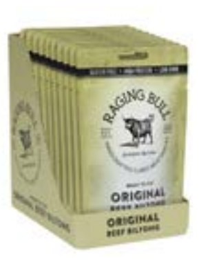
Original Beef Biltong 10 x 35g