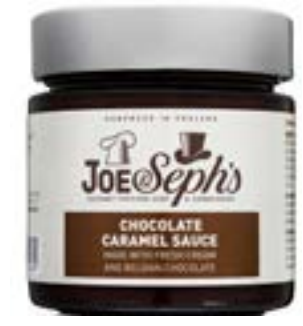
Chocolate Caramel Sauce