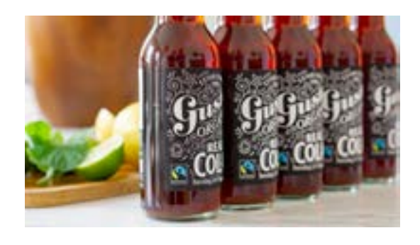
Gusto Organic fairtrade soft drinks