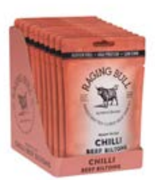
Chilli Beef Biltong 10 x 35g