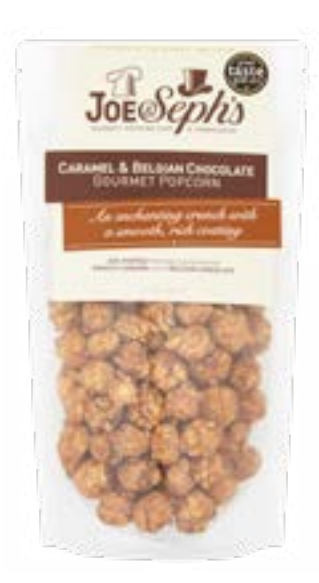
Caramel & Belgian Chocolate