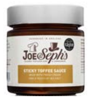
Sticky Toffee Sauce