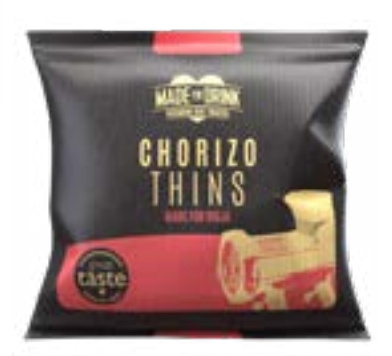
Chorizo Thins 10 x 30g