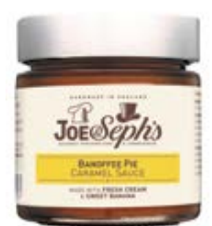
Banoffee Pie Caramel