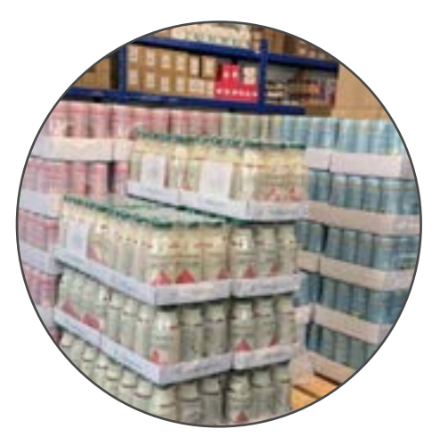
A local business and a personal service