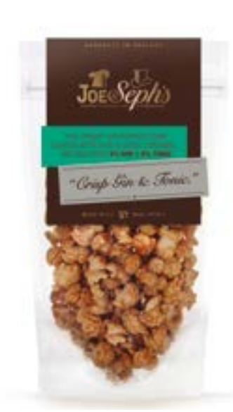
Gin & Tonic