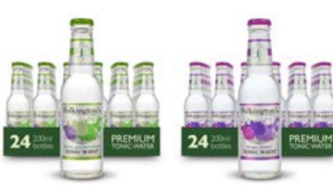
English Garden Tonic