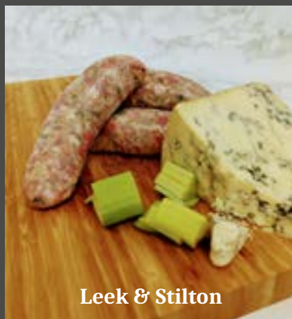
Leek & Stilton