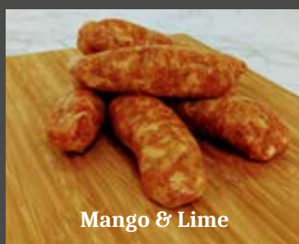
Mango & Lime