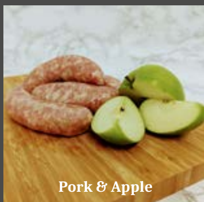
Pork & Apple