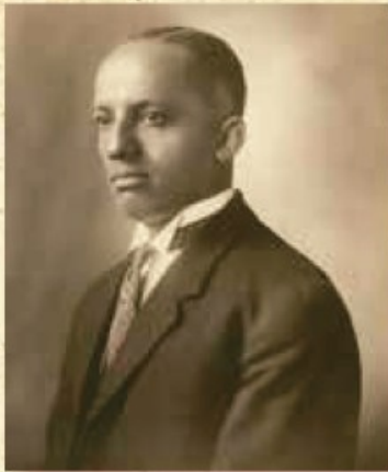
Dr. Carter G. Woodson

The genesis behind what is now Achievement Week is found at a significant event that occurred in Omega's history at the 9th Grand Conclave held at Meharry Medical College in Nashville from December 27-29, 1920. It was at this Conclave that Dr. Carter G. Woodson gave a stirring speech during the opening session on Monday evening, December 27, 1920, on "Democracy and the Man far Down." According to a fraternal publication, in his speech, Dr. Woodson: