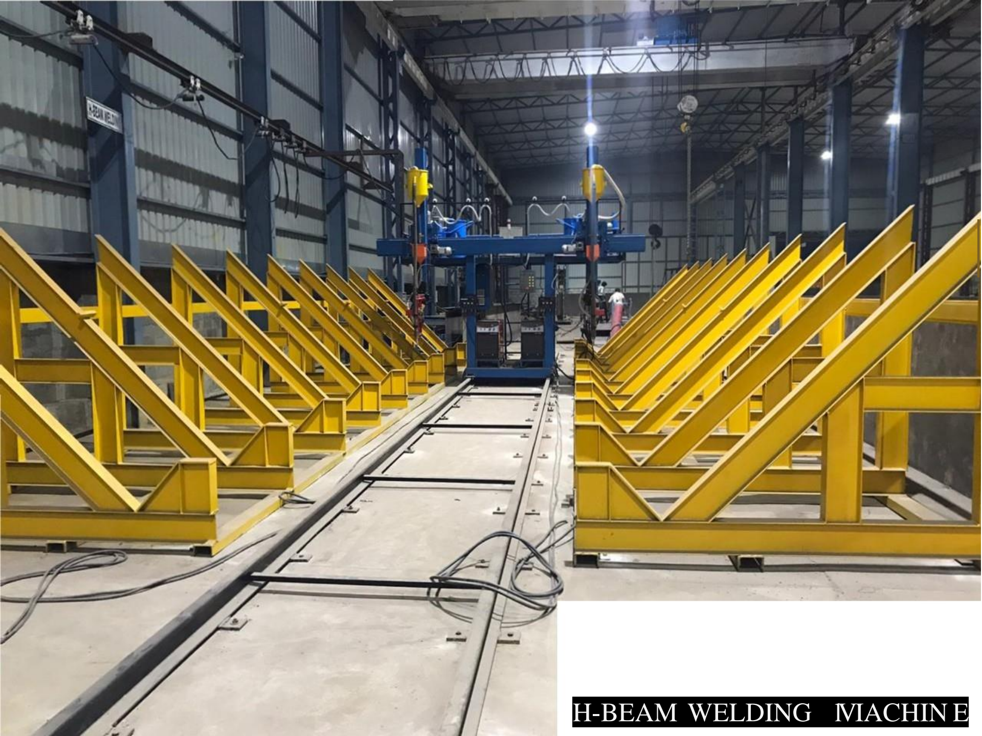
H-BEAM WELDING MACHINE