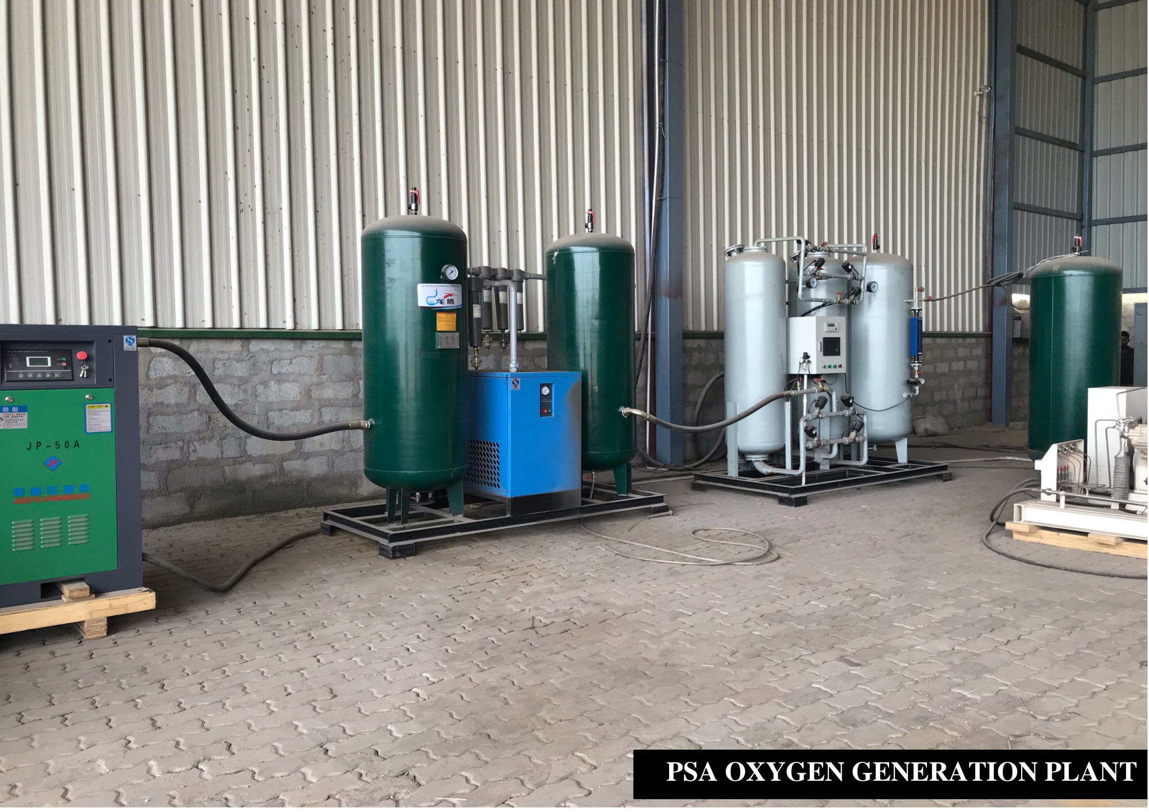
PSA OXYGEN GENERATION PLANT