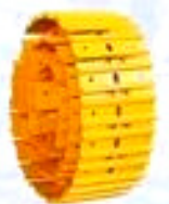
TRACK SHOE ASSY