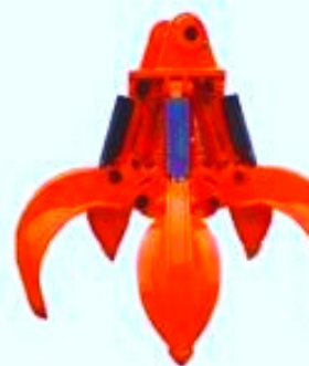
ORANGE PEEL GRAPPLE