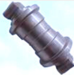
EXCAVATOR TRACK ROLLER