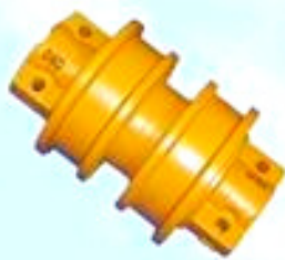
BULLDOZER--D6D-DF TRACK ROLLER