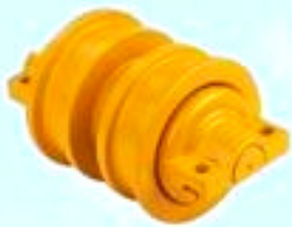
BULLDOZER TRACK ROLLER DF