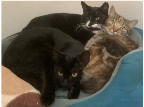
Kylie (black & white), Jilly, & Edna (tortie)

It is painful to report that we still haven't found homes for long-term residents Tania , Jilly , Kylie and Edna . Jilly (black with a small white patch on her chest) is nearly two now whilst the other three are about three years old. The girls are free to roam outdoors but they still don't have the luxury of living in a house or with a special family to care for them forever.