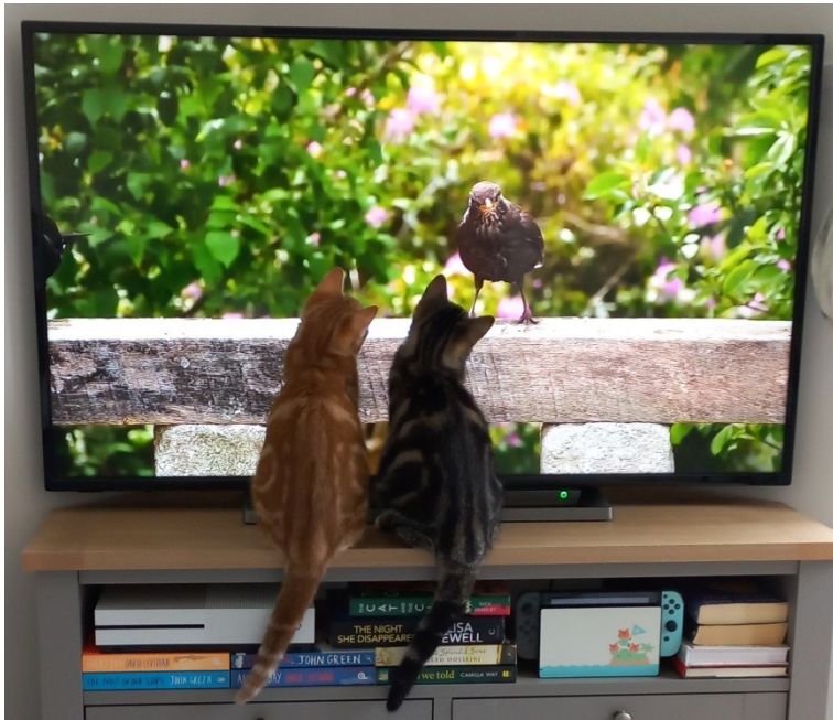
Brothers Aleksí (ginger) and Kimi (tabby)

Last year was difficult for all the animal rescue charities. There was a flood of abandoned and unwanted cats plus an alarming boom in kitten numbers. Hopefully 2024 will be better.