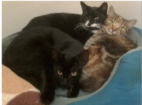
Kylie (Black &white) & Edna (tortie)

We still need homes for their mum Tania and two other feral cats named Kylie and Edna (aka Stripe ). These mums, who were also rescued with their kittens some time ago, have become inseparable. All three cats are still quite young (about 2-3 years old). They have been spayed, vaccinated and chipped.