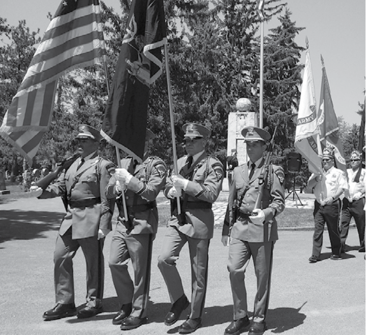
Amherst Police Honor Guard Williamsville Cemetery May 29, 2023.