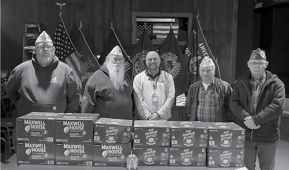
Post 245 donated K-Cups to the Bath VA for use in the domicillary by veterans.