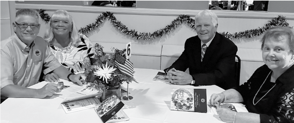
Post 76 having a grand ole time.