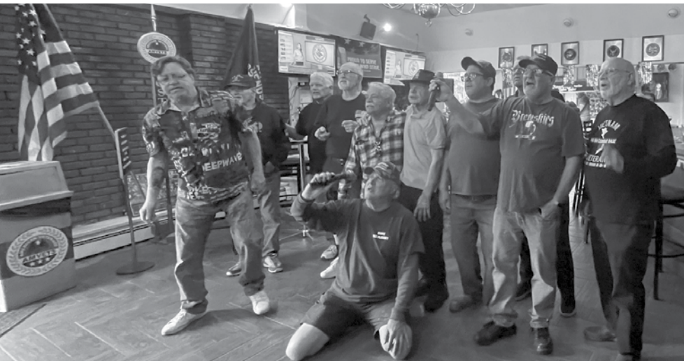
The men "Rock it out" for Karaoke afternoon...