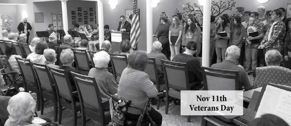
Nov 11th Veterans Day