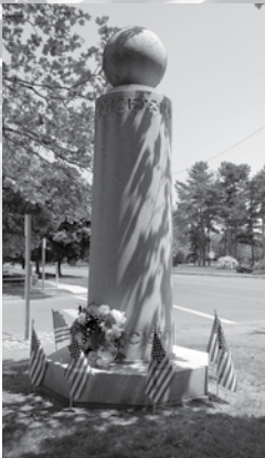
Memorial Day Remembrance at Veterans Monument Bailey & Main in Amherst, NY.