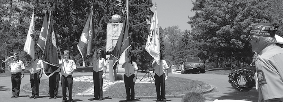
Ismailia Legion of Honor Service Flag Presentation.