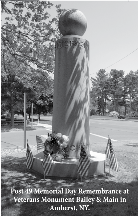
Post 49 Memorial Day Remembrance at Veterans Monument Bailey & Main in Amherst, NY.