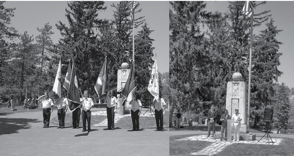
Ismailia Legion of Honor Service Flag Presentation.