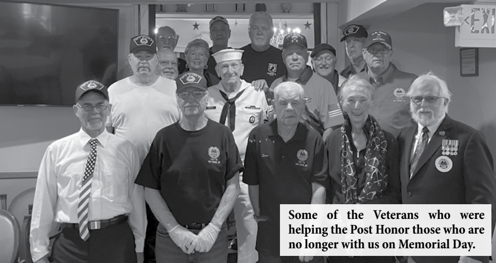
Some of the Veterans who were helping the Post Honor those who are no longer with us on Memorial Day.