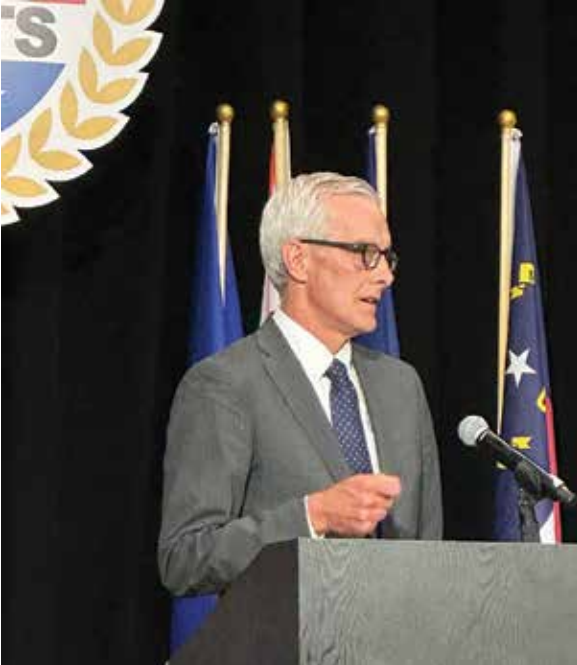
Hon. Denis McDonough, Secretary of Veterans Affairs addresses the membership.