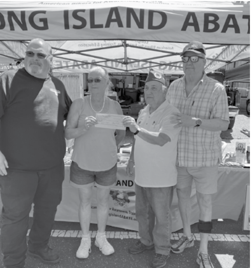
Post 48 donation to LI Abate.