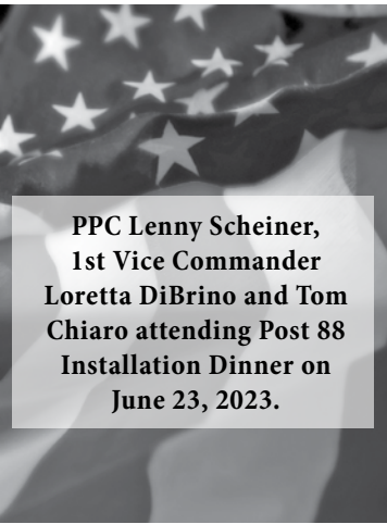
Honoring those who served and are missing or forever gone.