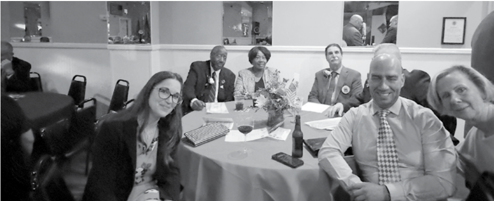
Post 10-13 from Queens, NY.