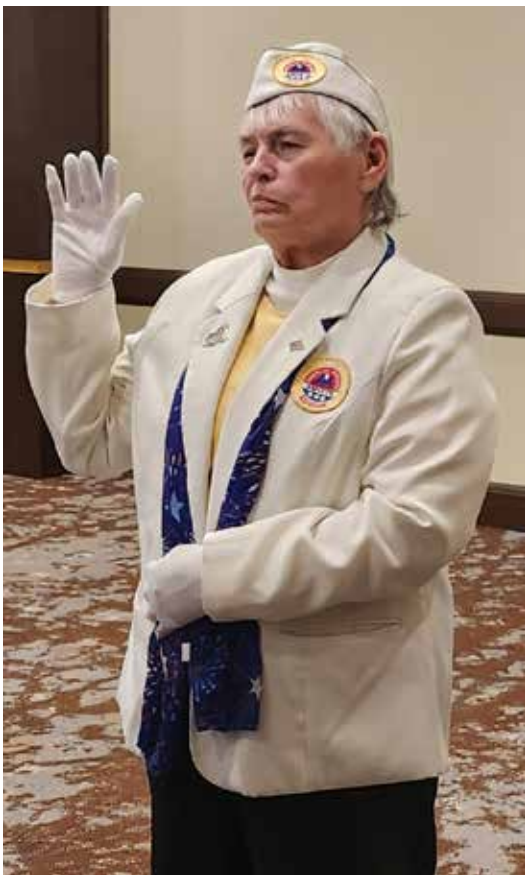
Amvets Auxiliary Lunch & Installation.