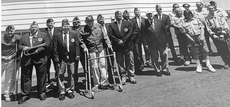
Members of Amvets Post 797, VFW Post 8162, American Legion Post 1268 and the Boy Scouts of America line up on flag day and prepare American flags for patriotic destruction after the ceremony.