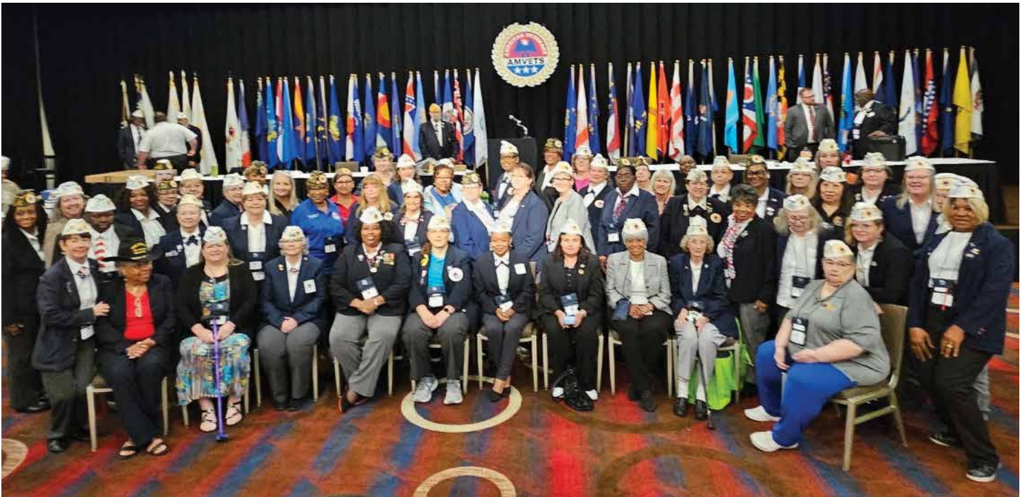
Women AMVETS gather for recognition.