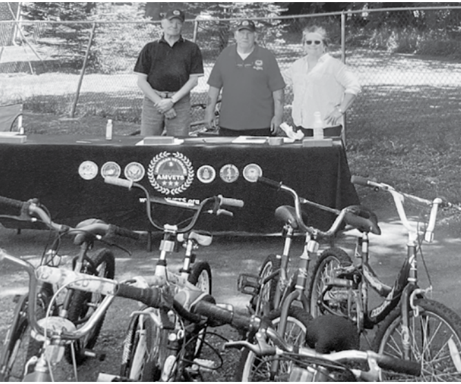
(L-R) at the AMVETS table