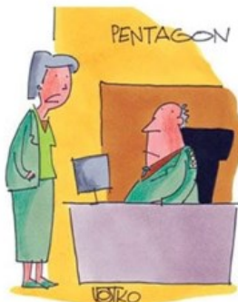
"It's Research and Development, General. They've come up with a Catch-23."