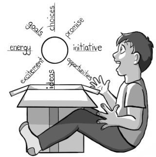
Appreciating His Gift of Today