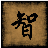
CULTIVATING WISDOM T'ai Chi Chih® International Teachers' Conference 2022