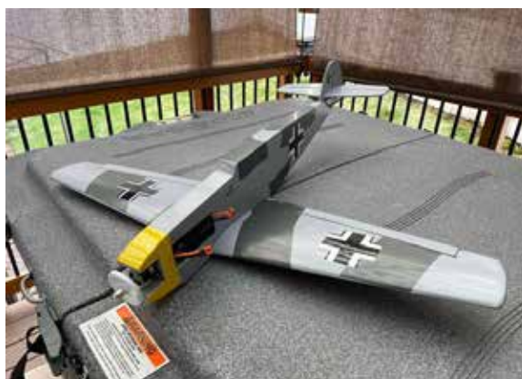
Tom Lincoln's ME-109 kit build