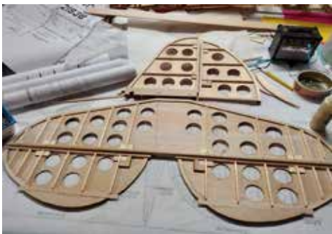
Dave Rawling's Cessna Airmaster with 8 wingspread!