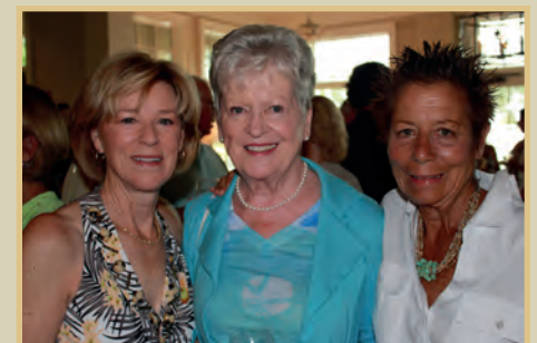
2014 Spring Benefit - Yankee Beef & Oyster Roast