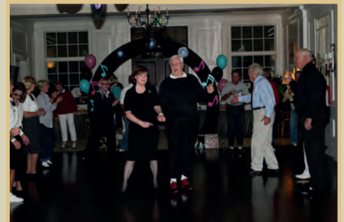
2013 Fall Gala & Auction - Sock Hop