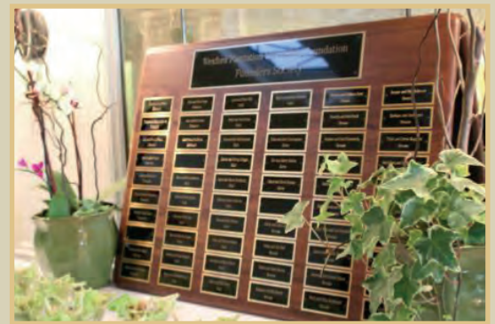
Plaque on display in the Clubhouse