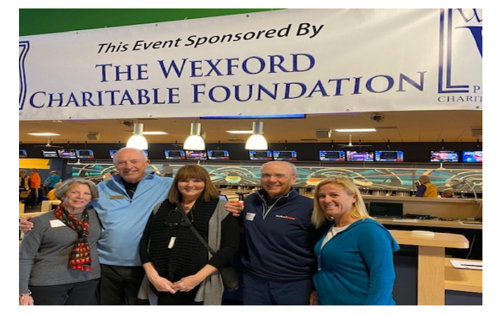
In December, several of the Wexford Foundation Trustees volunteered to help at the Special Olympics bowling tournament held over three days in Bluffton for special needs children and adults.

Visit www.WexfordFoundation.com to learn more about our recipient charities, our Foundation Committees and how you could become involved!