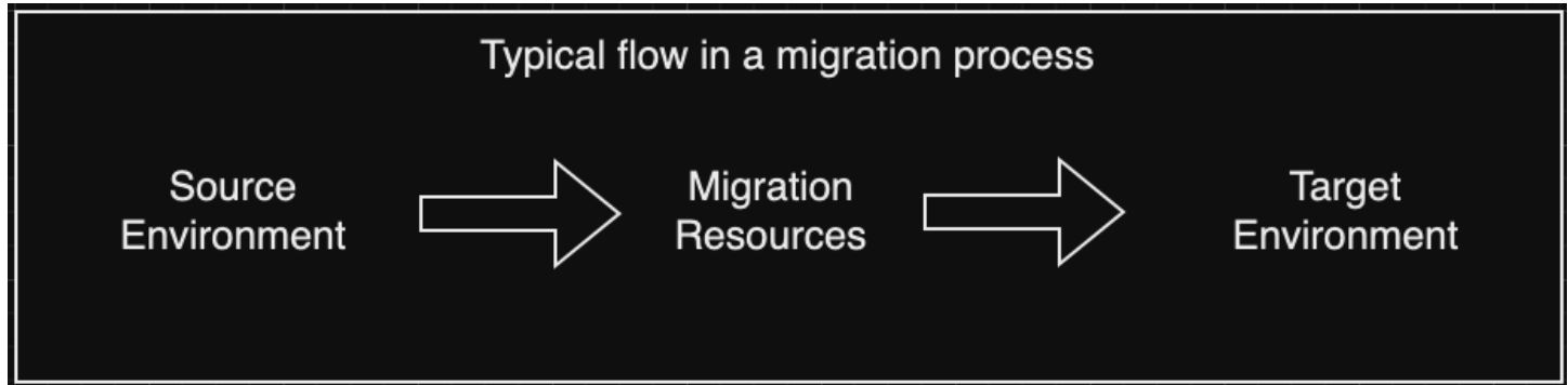
Typical migration process flow

During a migration, your consumption of resources may increase due to the provisioning of resources in both the source and target environments. The increase in consumption is often referred to as a double bubble . In addition, your consumption may also increase due to provisioning of migration resources, such as the networking between your source and target environments, SFTP servers, AWS Application Migration Service (MGN), or AWS Database Migration Service (DMS).