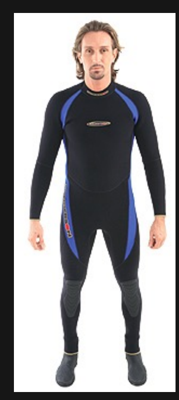
Full Suit is usually best .