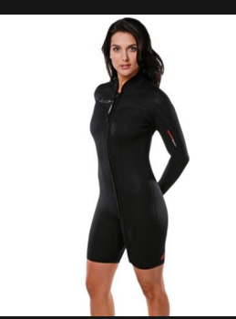
Shorty- for summer or Caribbean.