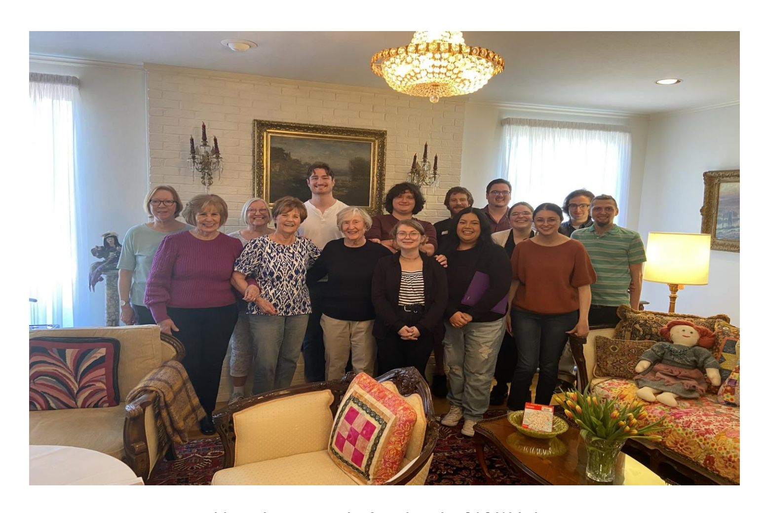
More pictures can be found on the GAC Website: https://gacofdallas.com/

I am grateful for having had an opportunity to facilitate such an impactful learning-experience, which provided my students with plenty of opportunities for hands-on-learning and skills development. Leadership, research, teamwork, intercultural and intergenerational communication skills come to mind. I am grateful for the trust placed in the students and myself. My hope is that many more joint projects will follow. Together, we can make the German element in Texas better known and keep it alive.